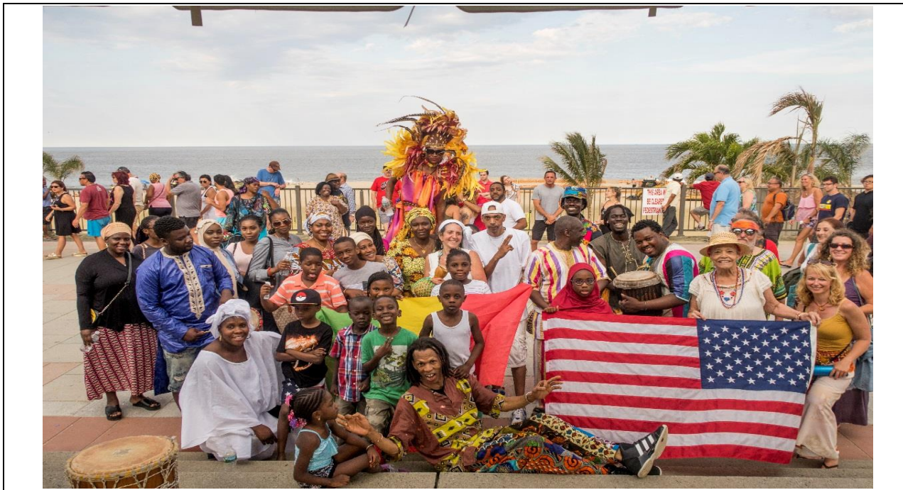
Oceans of Rhythm 2017

Info: Website: www.ZEYBRAH.org ; email: zeybrah@aol.com ; or telephone: 732-571-6545